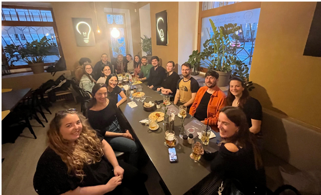
Photo from SORTEE meet-up at the 4th European Meeting of Young Ornithologists in Prague (March 21st to 24th).

If you're attending a conference we can support you to present a SORTEE poster and/or organise a meetup with other people interested in open science; see https://www.sortee.org/meet-ups/ for more information, and submit an expression of interest here . The full list of meet-ups already scheduled for 2024 and their organisers' contact details is available here .